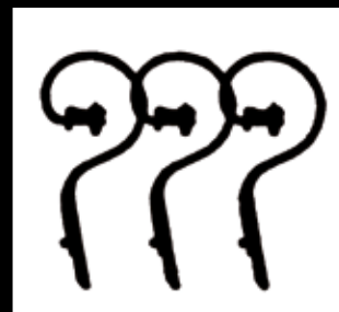
Three rows Straight tines 45 x 10mm