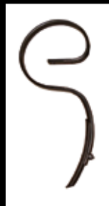
Semi-curved 32 x 10mm

The DK tine is forged from a ring of 22 mm diameter in a way to get the maximum thickness (15 mm) in the most stressed area of the spring. Without stripes, it guarantees a high resistance for working in the highest difficult conditions at high speed while keeping a high vibration capacity.