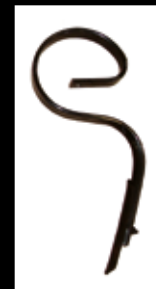
Straight 45 x 10mm