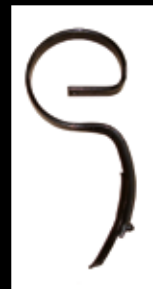
Semi-curved 45 x 10mm