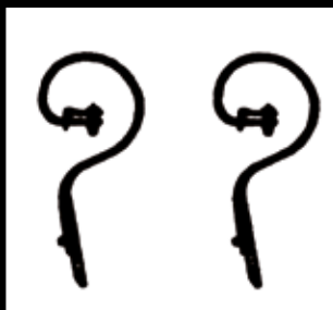
Two rows Straight tines 45 x 10mm

Possible drill combinations: SD3000M, SH1150, SD2000M, SD2000MP, PP1000.